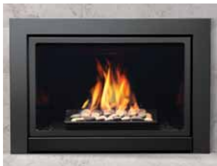
Unit illustrated is an IDV36N Direct Vent Insert – Natural Gas, I36CVBL Clean View – Black, MQRSP8 Glass Support Platform, MQSTONE Decorative Stones, IDV36PRL Porcelain Reflective Liner.