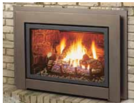
Unit illustrated is a IDV33LP Direct Vent Fireplace Insert – Propane, LOGF35 Split Fiber Oak Log Set, I33CVCV Clean View Kit – Vintage Copper Vein, I33S1CV Surround for Clean View – Vintage Copper Vein, IDV33RL Refractory Brick Liner.